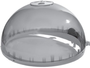
HAIR HOOD & WATER DRAIN